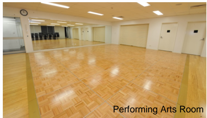
Performing Arts Room