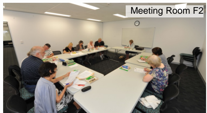
Meeting Room F2

With over 10 hireable spaces, Southport Community Centres offers various options for potential hirers. This venue is an ideal location for meetings, exercise classes, seminars, workshops, expos and events. The centre is available for hire 7 days a week, 7am – 11pm.