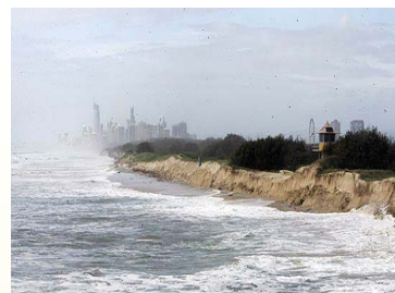
Figure 1. 22/05/09 The Spit during severe May storm