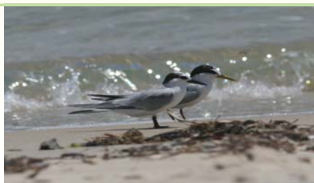
Figures 3 and 4 (above). Loggerhead Turtle and Little Tern are just two species that require a healthy beach (pictures taken on South Stradbroke Island, GCCC 2007)

Since sediment is constantly being redistributed—and coastlines and beaches are always on the move—plants, fish species and other marine life are well adapted to the natural processes of accretion and erosion - (Coastal and Hydraulics Laboratory 2007)