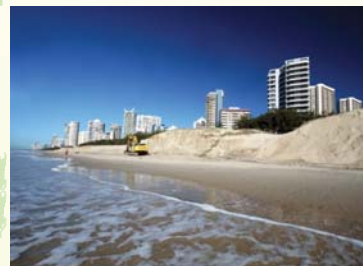
Figure 2. Reprofiling at Narrowneck three days later

In May 2009 a significant east coast low storm hit the Gold Coast region. The maximum wind gust recorded was 117km/h from the south east on 20 May 2009. The minimum pressure reading was 1008.3 hectoPascal on 21 May 2009. Figures 1 and 2 demonstrate the benefits of sand nourishment at Main Beach and Narrowneck in maintaining a healthy beach during severe storms. Previous beach nourishment campaigns assisted in minimising damage to shoreward properties and protected ecological communities on the dunes. For more information on this event, see Beach erosion events in 2009 – How did our beaches cope? information sheet.