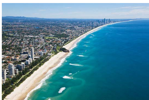
Aerial photograph of Miami Beach

Beach nourishment projects have been undertaken on the Gold Coast since 1974. They are designed to mimic natural coastal processes and allow sand to shift continuously in response to changing waves and water levels. They are a prime example of how Gold Coast City Council's coastal engineering activities are working with nature to care for our coast, and achieve better outcomes for the community, economy and environment of the Gold Coast.