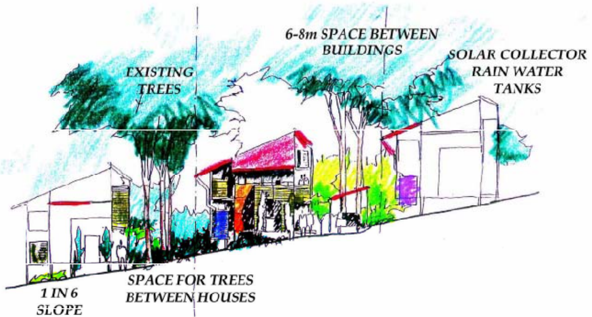
ELEVATION INDIVIDUAL HOUSES