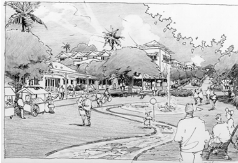
1B: MARKET SQUARE, BISCHOFF PARK