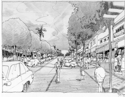
FIGURE 1A: LAVELLE STREET FIGURE