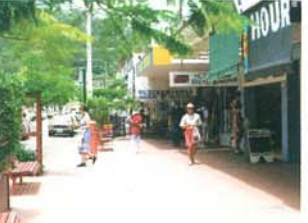
Example only. Not from Eagleby