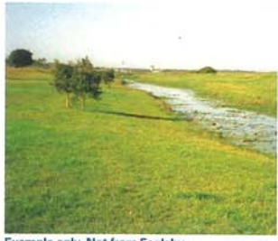
Example only. Not from Eagleby