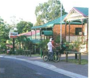
Example only. Not from Eagleby