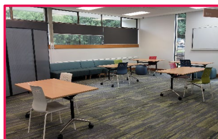
Runaway Bay Library