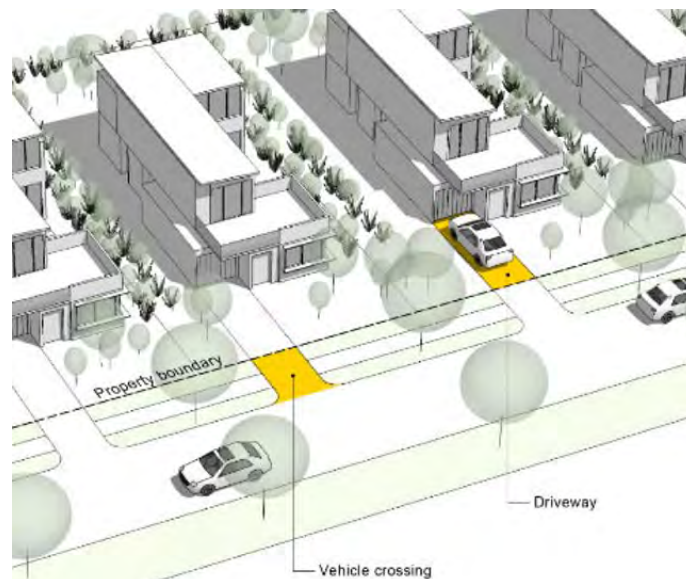
Figure 1: Conceptual illustration showing driveway and vehicular crossings location in relation to property boundaries and the road.

This is illustrated in the figure below: