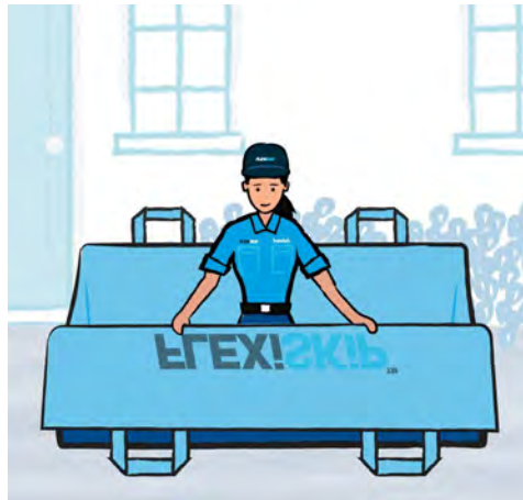
Step 2 - Lift up all four sides and fold one side out and down.