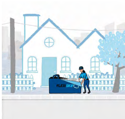
Step 5 - Once half-full, raise sides and place within four metres of the kerb. Check your local Council to see if a permit is needed and make sure FLEXi is clear of any overhead obstacles.