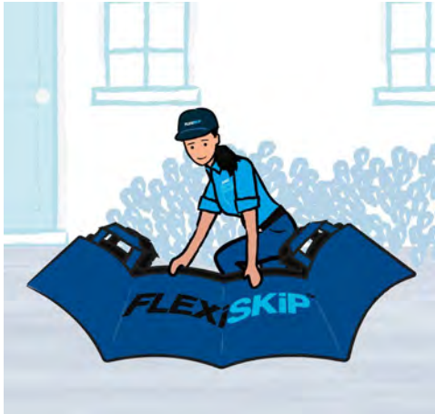
Step 1 - Unpack your FLEXiSKiP and lay it out, ready to be filled.