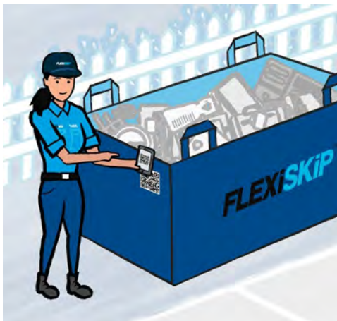
Step 4 - Fill your FLEXi up! Keep heavy items below the heavy fill line.