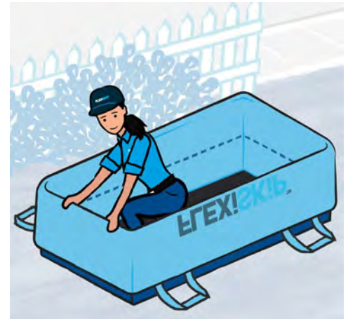
Step 3 - Fold out other sides and push out the bottom corners.