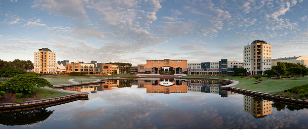
Photograph 6.2.187-1 Example of an Innovation zone located at Bond University.