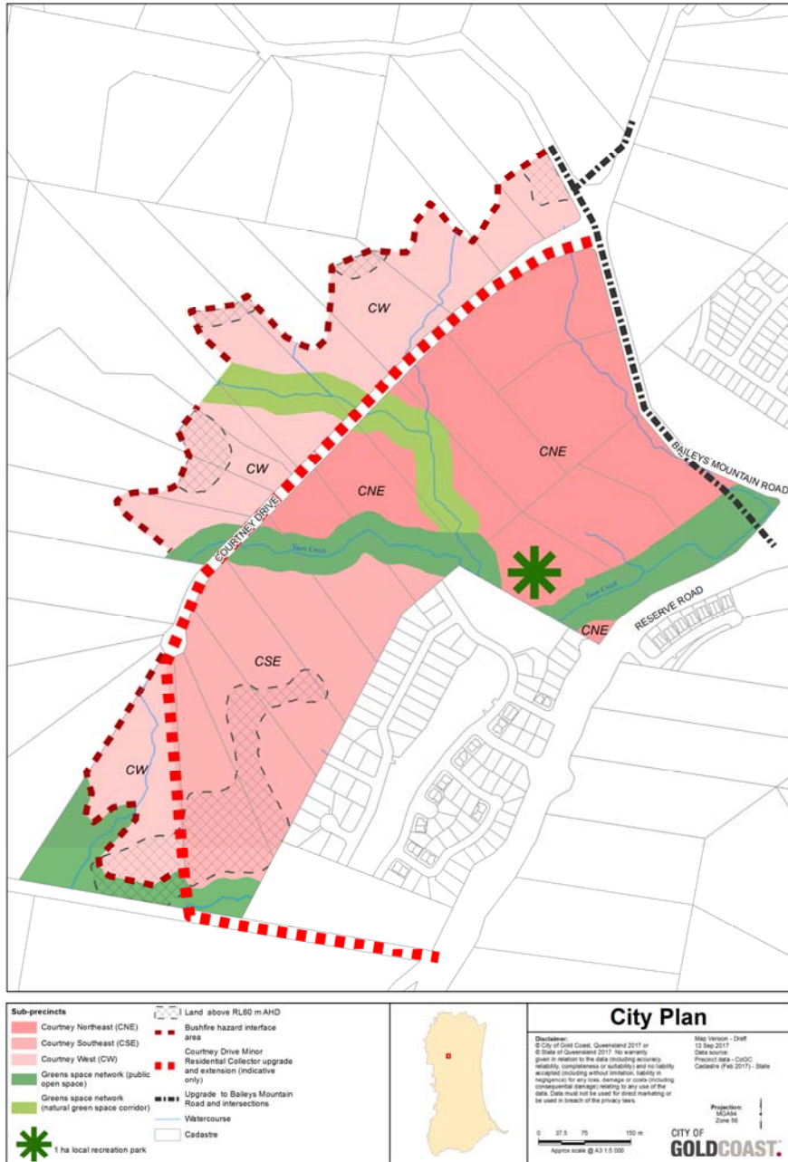
Figure 6.2.16-3 Upper Coomera (Courtney Drive) precinct plan