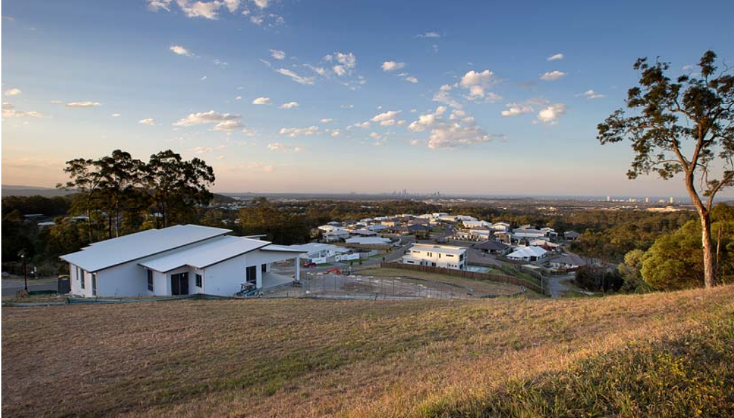
Photograph 6.2.16-1 Example of an Emerging community zone located in Reedy Creek.