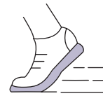
Gold Coast Marathon

Economic impact of sport events supported by City of Gold Coast and Major Events Gold Coast