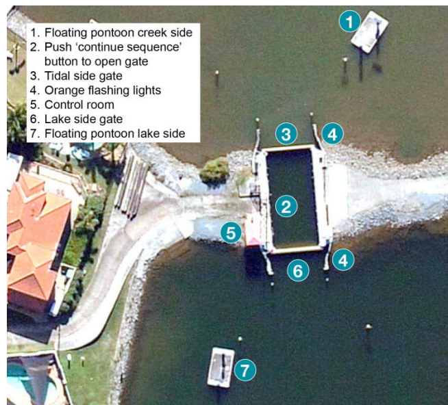
Figure 1. Monterey Keys lock

Do not waste the remote's battery. Before commencing a boat trip, test the remote once to confirm battery status. If pressing the button causes the LEDs to flicker the battery is satisfactory. Unnecessary button operation will reduce the remote's service life. Should the remote's LEDs fail to operate, the remote should be returned to the City of Gold Coast for replacement.