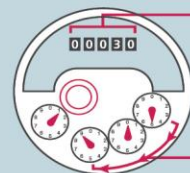
Numbers and clock meter