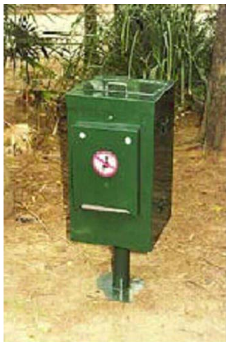
DOG REFUSE BIN

WHERE POSSIBLE ALL FIXINGS TO BE TAMPER/VANDAL PROOF TO MINIMISE DAMAGE OR THEFT.