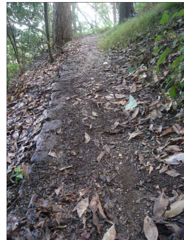
CORRECT PLACEMENT OF TOE STONES