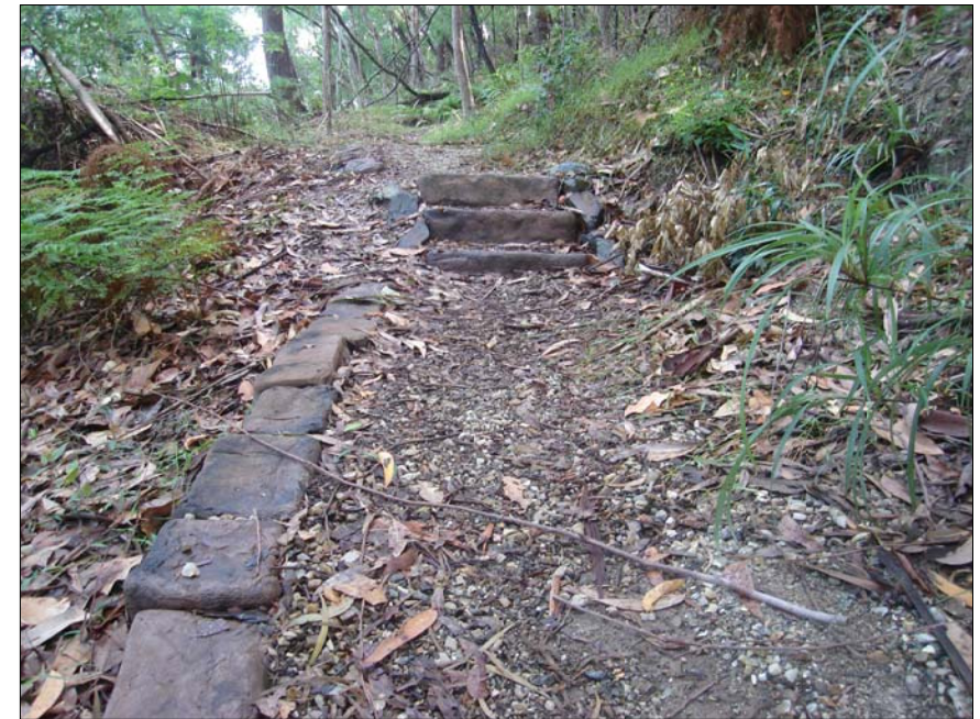
INCORRECT PLACEMENT OF TOE STONES